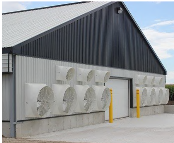
Tunnel exhaust fan bank in broiler barn.

At a certain ambient temperature, further increases in the ventilation rate are not effective in helping animals lose heat, resulting in decreases in production as the animals experience heat stress. In these cases, water-based cooling systems may be best. Water-based cooling systems use water to absorb excess heat energy from the barn air space and lower the ambient temperature. These systems include sprinklers, drippers, misters or evaporative cooling pads (in combination with tunnel ventilation). While they may be effective at reducing temperatures or cooling the animals, water-based cooling systems also increase the relative humidity in the facility. To ensure acceptable humidity levels in the housing, water-based cooling is best used when the outside ambient relative humidity is less than 70%.