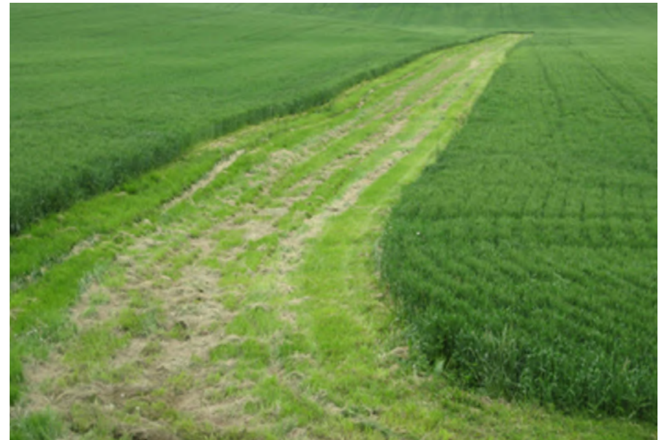
Landscape and constructed features, such as grassed waterways, are an important part of a strategy to manage extreme overland flows of water.

Refer to Erosion Control Structures for information on managing runoff from intense storm events.