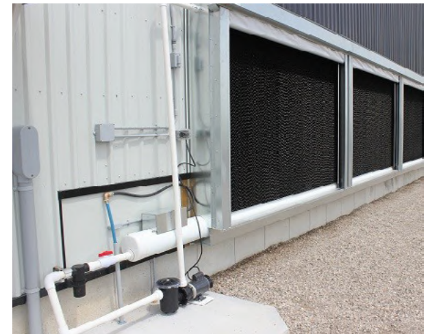
Evaporative cooling pad.