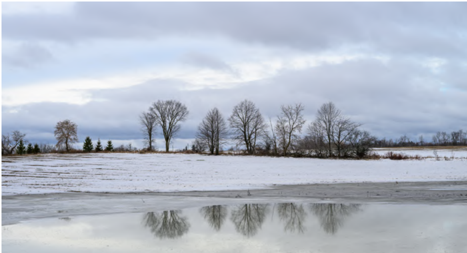
Extreme weather events can result in flooding which impacts farm infrastructure.

It is important for farmers to take proactive steps to plan for and mitigate flood risks. By integrating climate change adaptation into their farm management strategies, farmers can better protect their infrastructure and maintain operational continuity in the face of increasing flood risks.