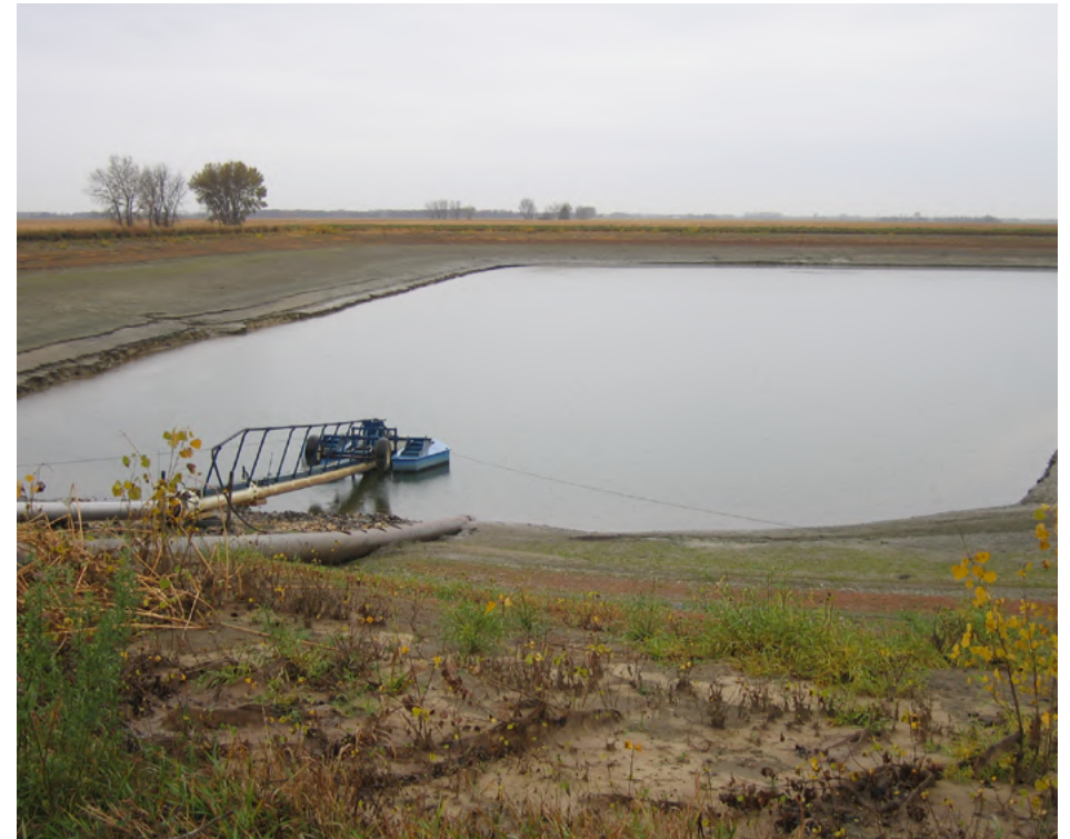
Constructing water storages can increase resilience during drought.