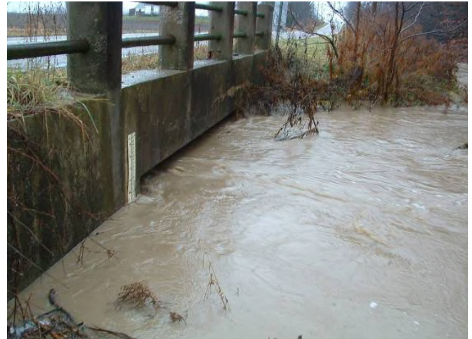
Constructed drainage infrastructure such as culverts may need to be enlarged to support current and future heavy rainfall events.

Refer to the OMAFA factsheet Grassed waterways to properly size and construct grassed waterways to safely transport water through farm fields.