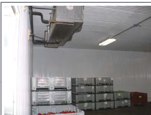
Ensure the refrigerated storage facility is insulated and sealed to prevent the entry or escape of air and provide good air distribution within the storage.