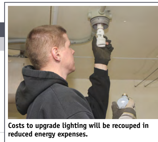
Costs to upgrade lighting will be recouped in reduced energy expenses.