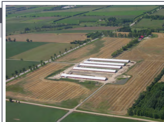
Quality construction will reduce energy costs while maximizing the useful life of farm buildings.