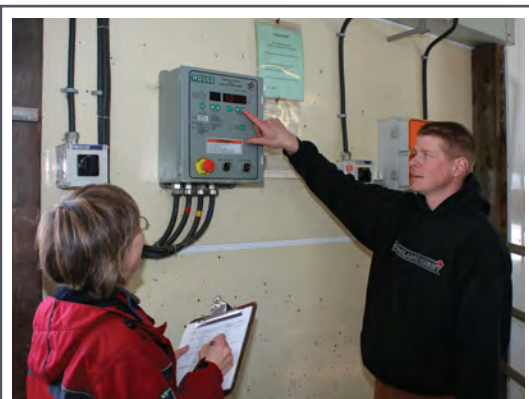
Determining current energy usage is the first step in making energy improvements in your operation.