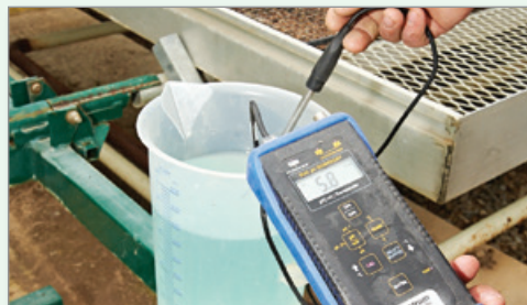
Regular testing of both irrigation water and media EC and pH can help to avoid nutrition and disease problems before they occur.