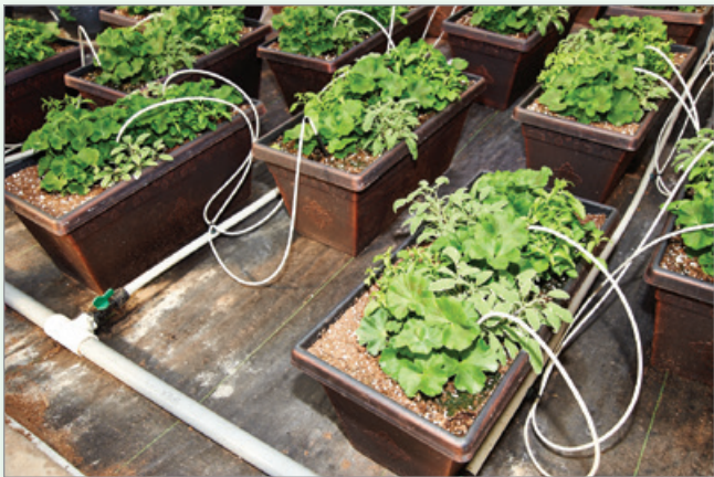
Pressure compensated low volume drip systems use less water and eliminate water loss between pots.