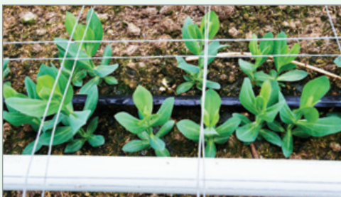
Know your soil type and regularly monitor EC and pH of growing beds.

If growing in ground, test and sterilize soils between production cycles. Monitor EC, and adjust pH and nutrients as required.