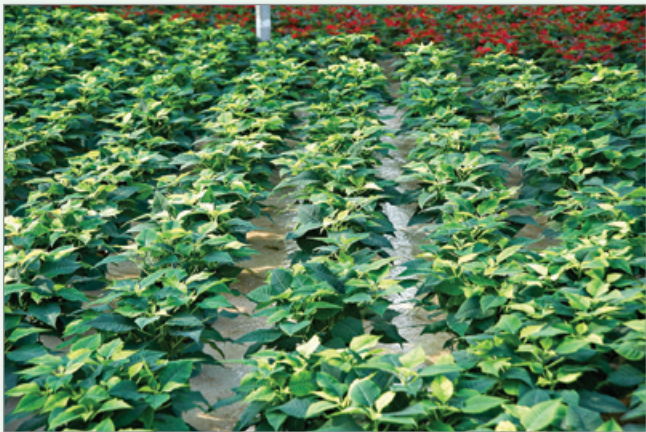
Sub-irrigation systems will only conserve water and nutrients in greenhouse production if water is collected, stored and reused.

B.8 If you use sub-irrigation, what percentage of your sub-irrigated production area is closed? A closed system is where irrigation water is collected, stored and reused for a future irrigation event.