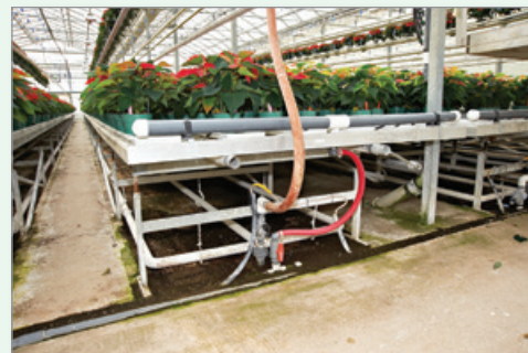
Collect and reuse leachate from overhead applied nutrient rich water applications if possible.