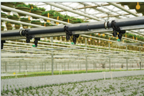
Overhead applied irrigation water is collected in a closed irrigation system.

Stay informed on the latest fertilizer research. Emerging formulations may offer benefits such as timed nutrient release which can be helpful for reducing nutrient levels in leachate overall.