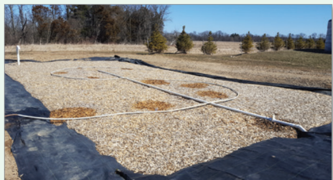
A vegetative filter strip (left) and a woodchip bioreactor (right) are water treatment options.