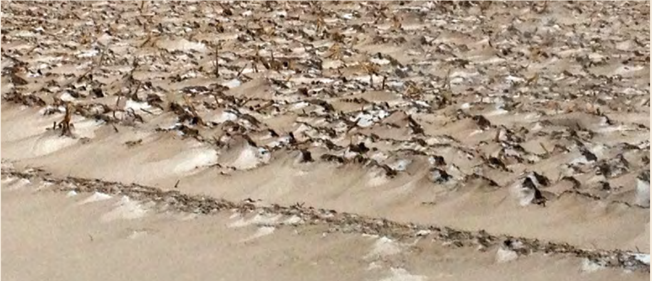
Dirty snow on cropland is an indicator of wind erosion during the winter months.

Wind erosion reduces the quantity and quality of soil within a field. The process of wind erosion is: detachment → transport → deposition .