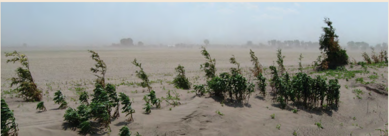
Wind can move the soil in many different ways. Saltation is the main mechanism by which soil moves around a field. Both saltating and suspended soils cause crop damage and move the fine soil particles off a field.

Suspension is the movement of dust-sized soil particles (less than 0.10 mm in diameter) or very fine sand and silt particles) parallel to the soil surface.