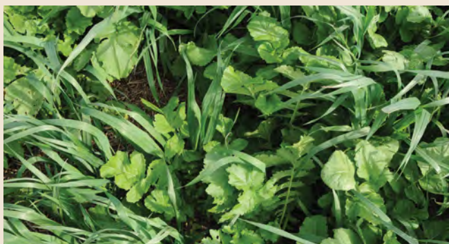
A multi-mix cover crop mixture with oats and oilseed radish fits well after winter wheat in a corn/soybeans/winter wheat rotation.